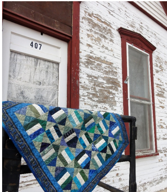
“DAYLIGHT INTO DARKNESS”, 2001

PHOTOGRAPHED AT ROCKY FORD’S FIRST SCHOOLHOUSE IN 2022