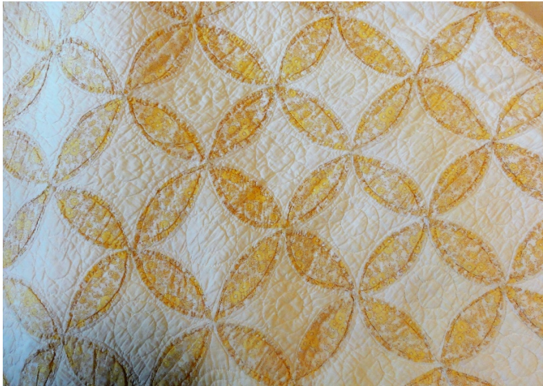
“ORANGE PEEL” MADE BY GRANDMOTHER HAINES, HAND QUILTED BY GRAND VALLEY LADIES AID, c1940 IN ROCKY FORD