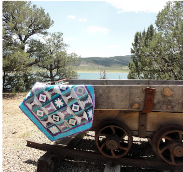
“TERTIARY TRIALS” 2023