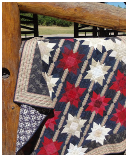
“RISING STAR” 1996