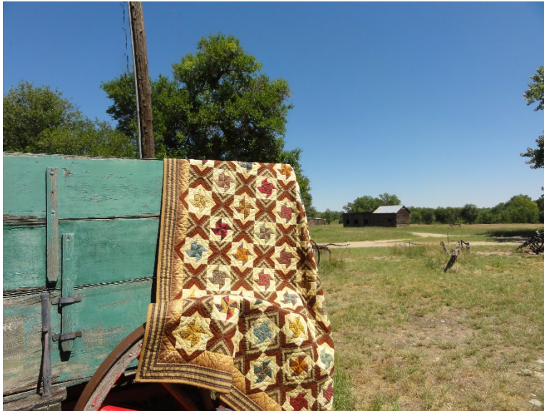
“SUNDAY DRIVE”, 1995

PHOTOGRAPHED AT BOGGSVILLE, BENT COUNTY, 2022