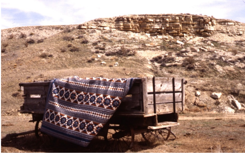
“NAVAJO BEAUTIFUL STAR”, 1986

PHOTOGRAPHED AT 1876 HAINES HOMESTEAD ON LAMBING WAGON IN 1991