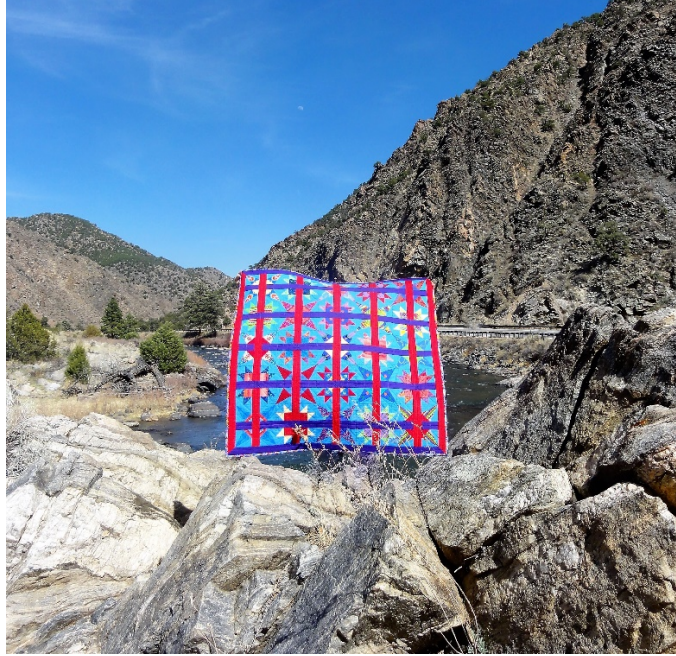
“WILD CHILD”, 2016-2022