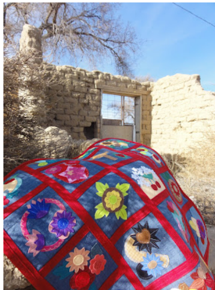
“FOLAGE, FLORALS, ETC.” 2022

PHOTOGRAPHED AT HORSE BARN, ARKANSAS VALLEY FAIRGROUNDS, ROCKY FORD, 2023