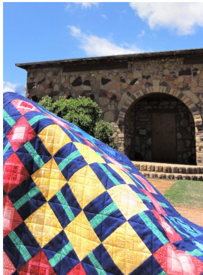
“SQUARE DANCE”, 2022