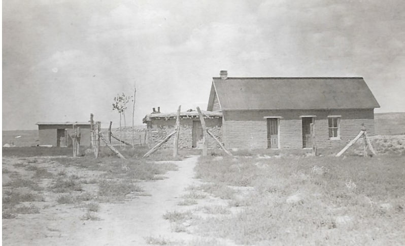
HAINES 1876 HOMESTEAD SOUTH OF ROCKY FORD NEAR TIMPAS