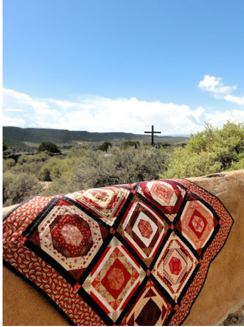
“MELODIC MOTIFS” 2023