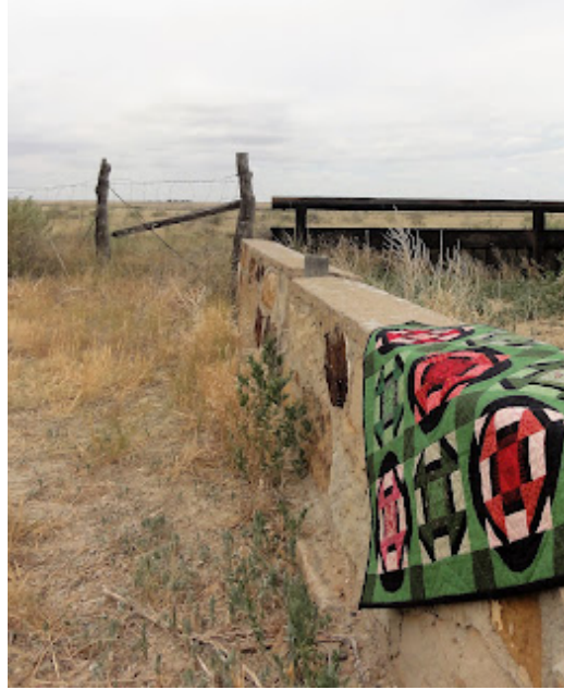
“MANY MOONS AGO” 2022

PHOTOGRAPHED AT SANTA FE TRAIL NEAR TIMPAS, 2022